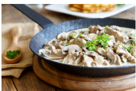
Grilled or fried veal with dark sauce