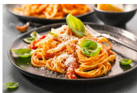
Soft cheese from cows' milk