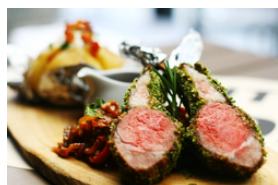
Lamb in a light sauce