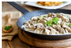
Hard cheese made from cows' milk