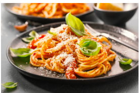
Beef, veal or game in a dark sauce, grilled or fried beef or game