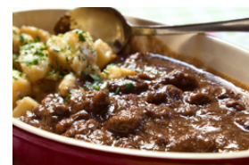
Game in a dark sauce, also grilled or fried