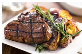
Beef in a dark sauce, also grilled or fried