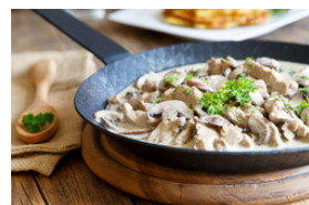
Veal in a dark sauce