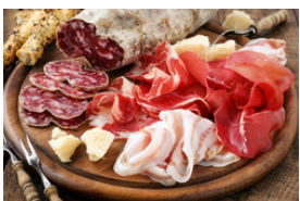
Veal in a pale sauce